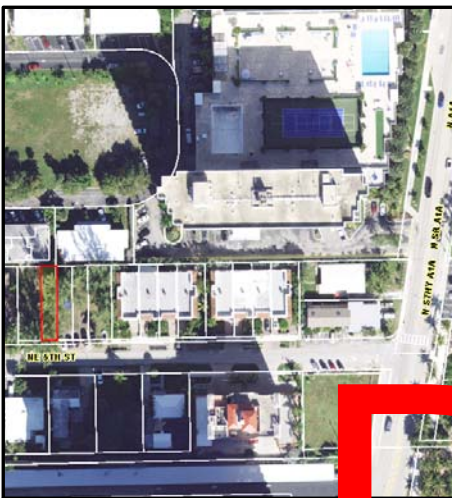
AERIAL MAP (NOT TO SCALE)

FLOOD ZONE INFORMATION Community No. 120055 Panel No. 0377 Suffix: L FIRM Date: 09-11-2009 Flood Zone: AE + 5'